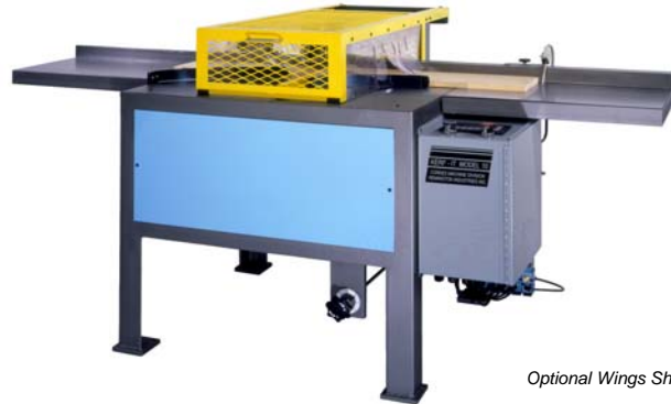
Optional Wings Shown

After cutting, the operator has a default choice of repeating pitch, depth and board length or changing selections.